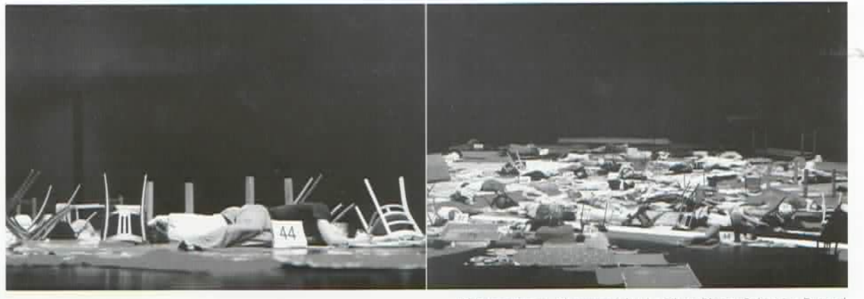
40 Espontáneos, Choreography: La Ribot, Photo: Sebastian Durand

close do we sit to these 'props' (if indeed that's what they are) without risking being drawn into the action of the performance? Admittedly I'm slightly prepared for this, having seen La Ribot's series of distinguished pieces in galleries where the audience navigate their own pathway, parallel to La Ribot's journey through the stations of objects.<sup>2</sup> However, the piles of clothes and upturned furniture, the spillage of theatricality and symbolic objects beyond the frame, particularly violate the architecture of the proscenium. The frontal representational apparatus of the theatre has collapsed producing a strange feeling of vertigo. Although eventually everyone sits somewhere, this moment of suspension, of an active re-engagement in the plane of vision extends throughout the piece.